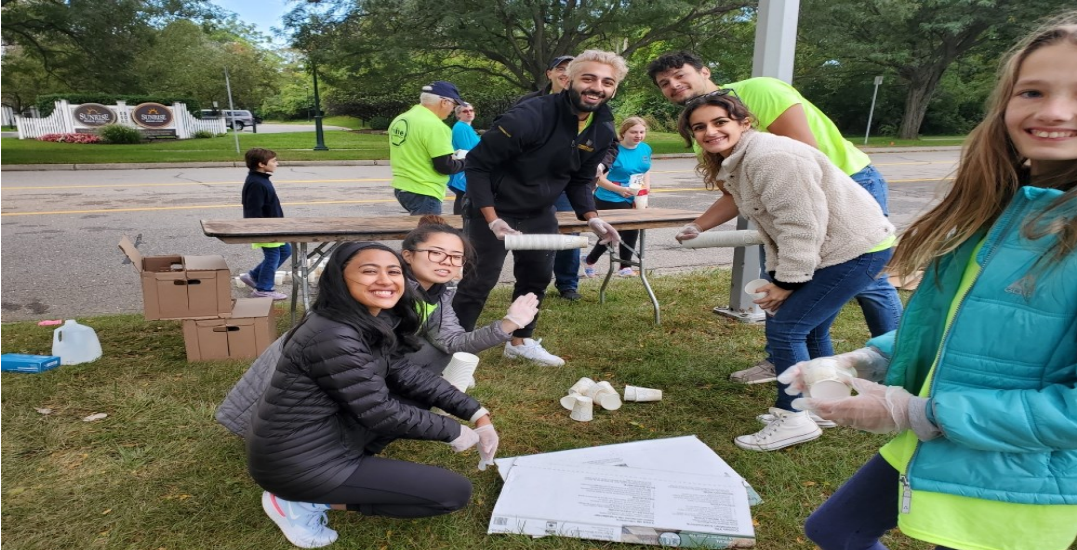
The team starting to set up the watering station.