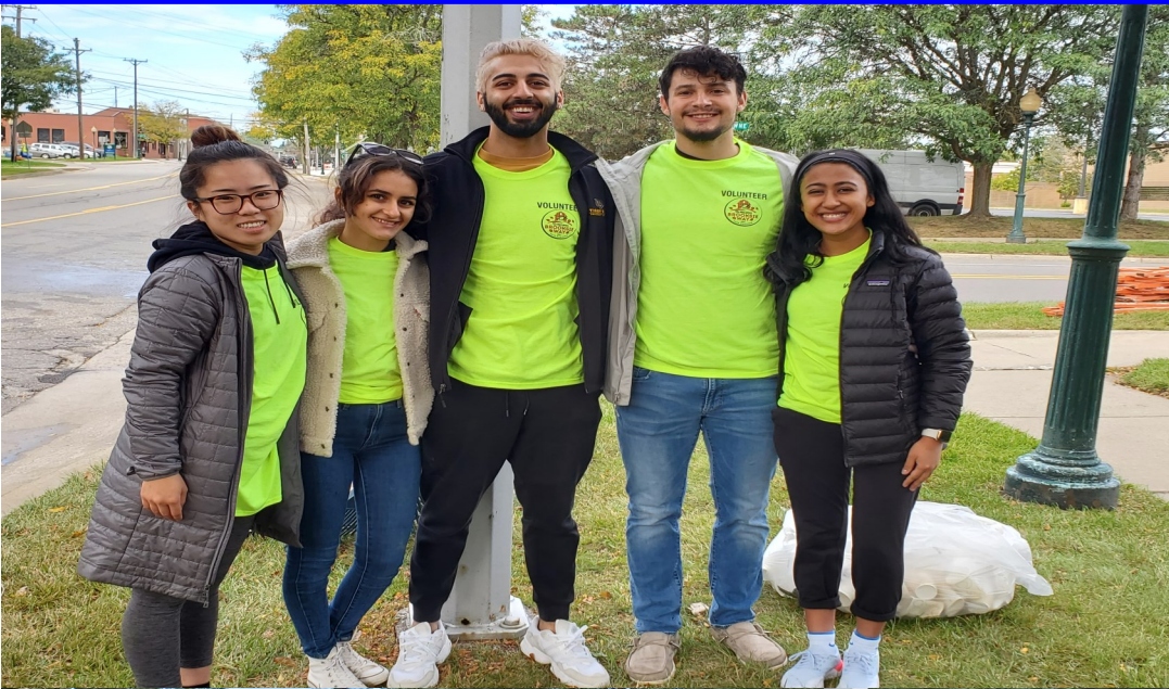
Oakland University Medical students: (left to right)